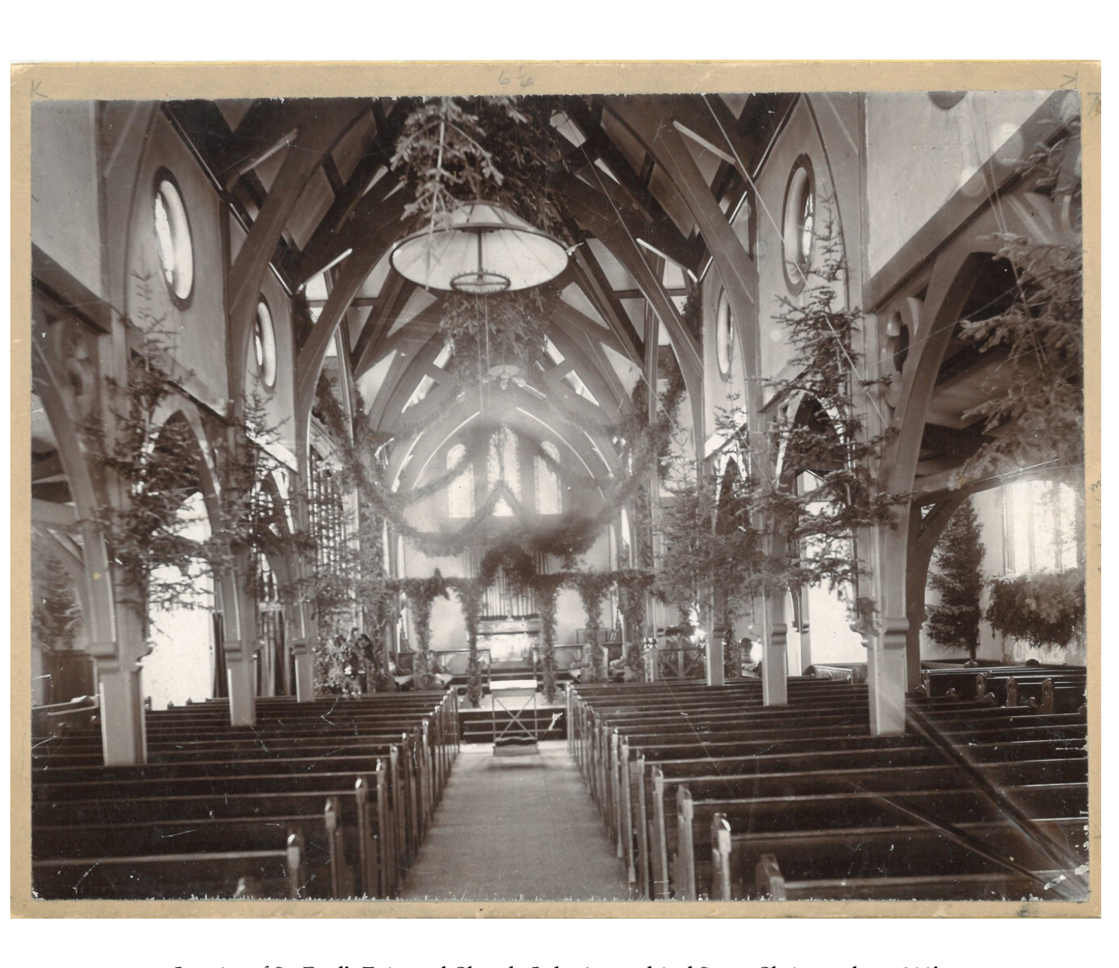
Interior of St. Paul's Episcopal Church, Lake Ave and 2nd Street Christmas late 1800's